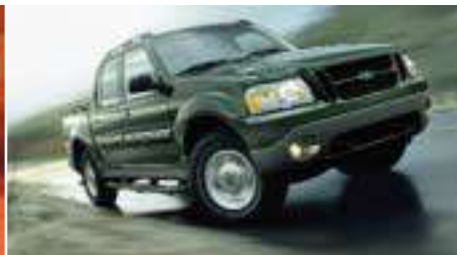
EXPLORER SPORT TRAC