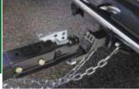
7-wire trailer wiring harness and frame-mounted hitch receiver (shown with aftermarket hitch equipment).