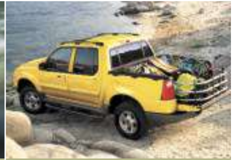
EXPLORER SPORT TRAC

The innovative 4-door Explorer Sport Trac combines the comfort and convenience of an SUV with the added utility of a flexible, open cargo area for “one vehicle does it all” versatility. Rugged, athletic styling shared with the Sport model makes Sport Trac the most versatile and active model in the Explorer lineup.